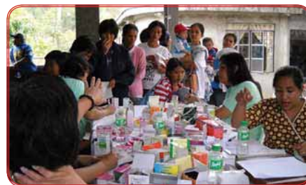
PNAMC members staff the "Pharmacy"—Patients waiting in line for free medicines