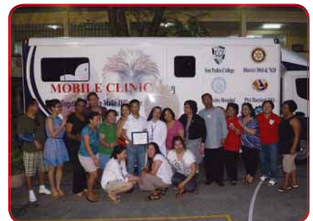
Dedication of the Mobile Clinic, February 6, 2012, San Pedro College, Davao City, Philippines