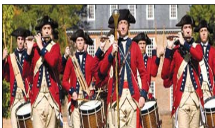
Soldiers in revolutionary uniforms