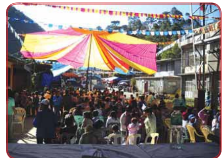
Patients waiting to be screened and treated, PNAMC Health Mission, February 2012